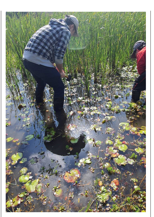
Above : Field sampling at a wetland in New Taipei City, Taiwan

Taiwan University. The Ho Lab studies cyanobacteria, particularly their environmental diversity and abilities to withstand extreme environments, as well as their photosynthetic mechanisms, and potential practical applications.